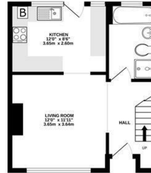
GROUND FLOOR 354 sq.ft. (32.9 sq.m.) approx.